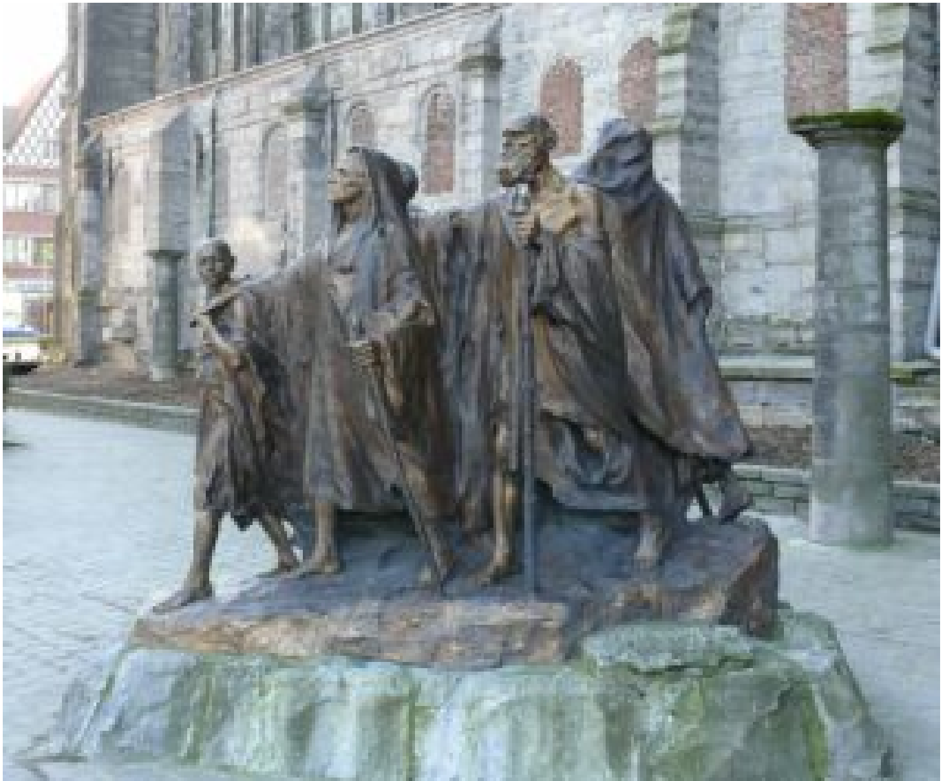
„Les Aveugles” - Guillaume Charlier

3. You have a rather classical art training, which, to my mind, is necessary no matter what direction one chooses later on. Do you think this is the case or can you be a true artist without having solid knowledge of, say, anatomical drawing? Also, what do you think the golden ratio is between technique and spirit in a piece of art?